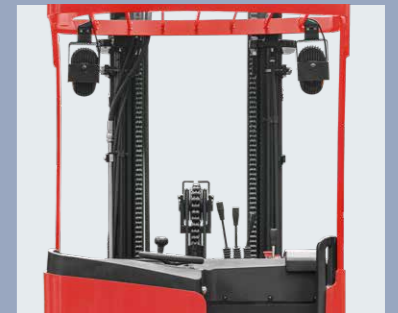
New designed mast and the large open steel roof provide super visibility and safety